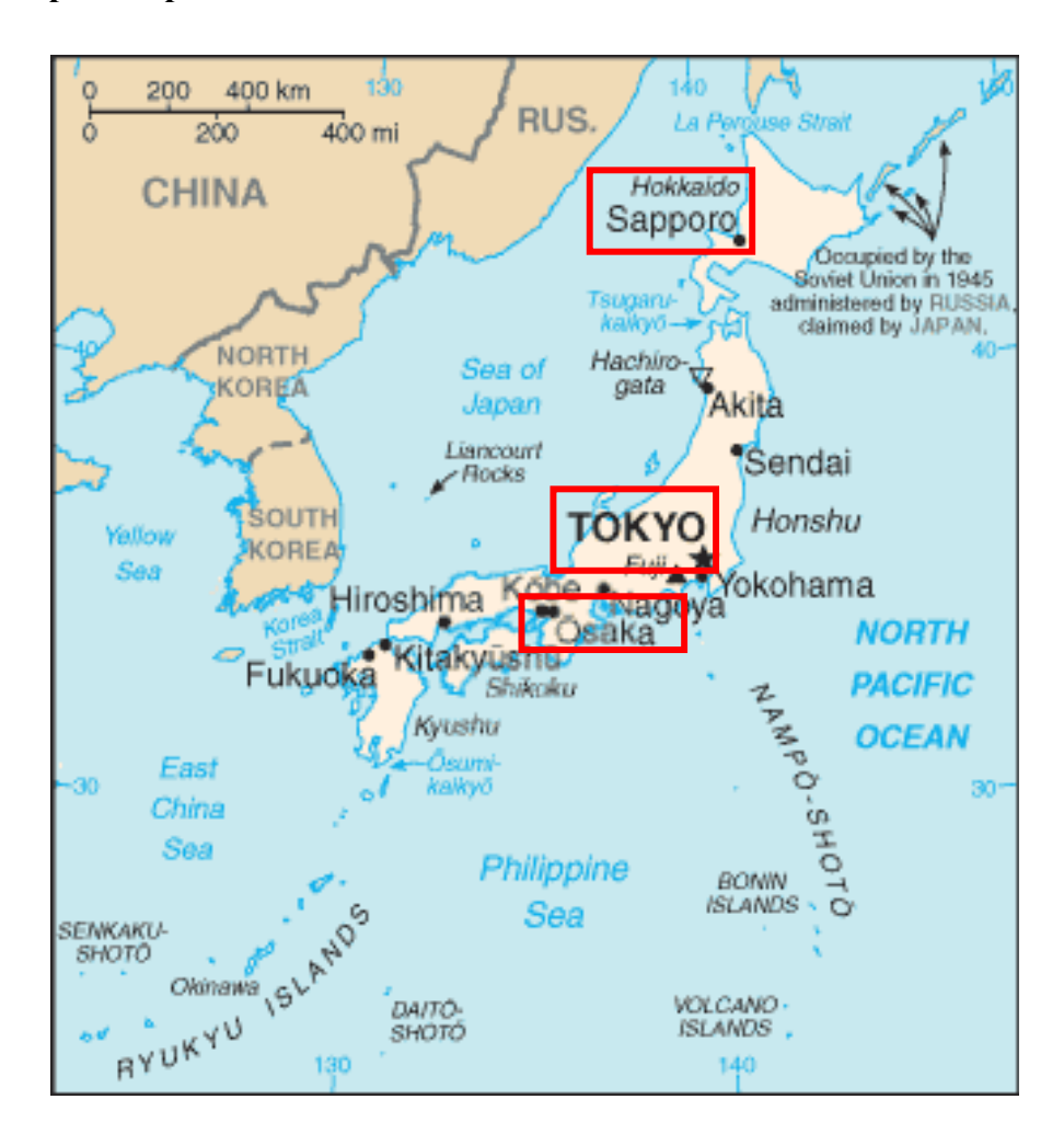
Figure 4: Japan Map